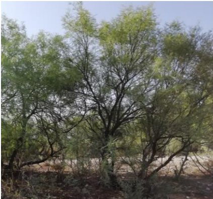
Fig 1. Prosopis laevigata Humb. et Bonpl. ex Willd

Prosopis laevigata is a native tree from México. The Wood of P. laevigata contain several phenolic compounds with cytotoxic properties